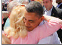
Prez Barack Obama greets crowd outside a cafe in Monroe City