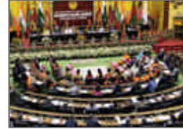
16th SAARC Summit in session at Grand Assembly Hall, Bhutan