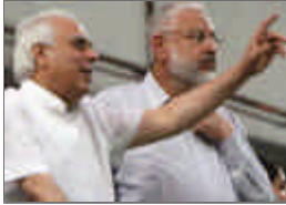
HRD Minister Kapil Sibal enjoys a match at Kotla in New Delhi