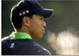
Tiger Woods during a golf tournament in North Carolina, USA