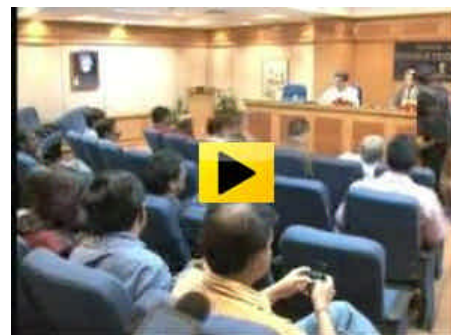
Krishna to visit China

Submit your Videos along with brief captions: To the Webmaster .